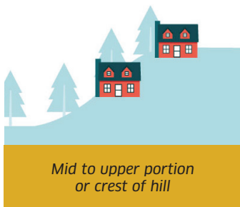
Mid to upper portion or crest of hill