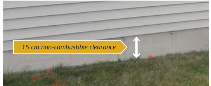
15 cm non-combustible clearance