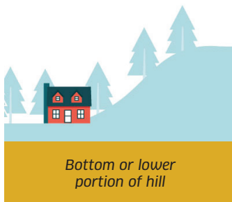
Bottom or lower portion of hill